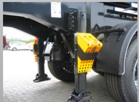
Landing legs, single-side operation