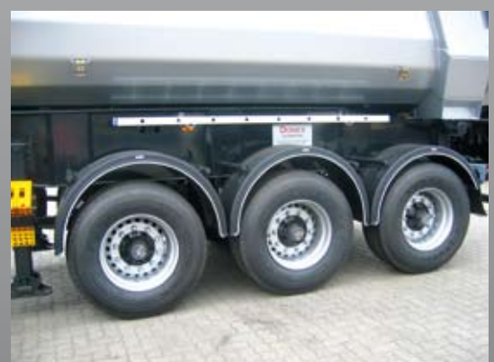
Plastic half-pipe fenders