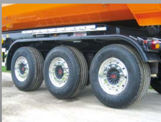
Continuous plastic fender