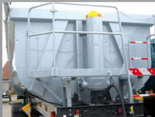
Platform at bulkhead