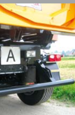
ible hinged underride guard