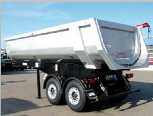
2-axle semitrailer with internal tailgate