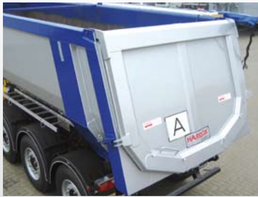
External tailgate with rectangular body end