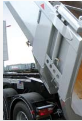
Top-hinged hydraulic tailgate with lock-out feature