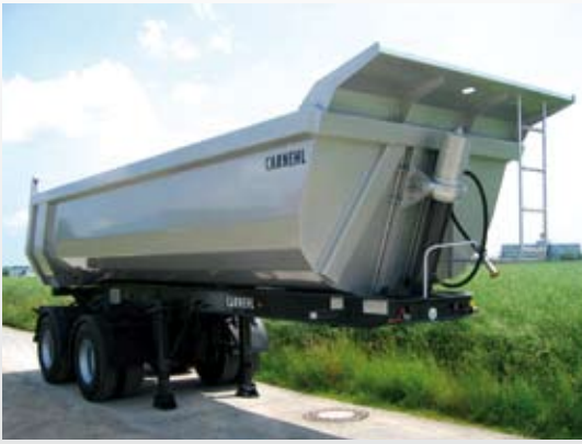
2-axle semitrailer with slanted bulkhead, dual wheels