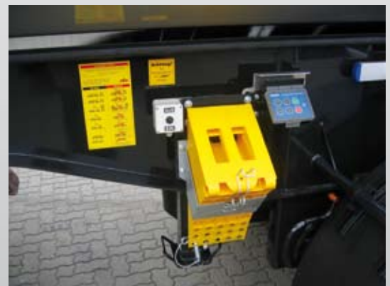
On/Off switch for tipper control Up/down switch