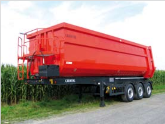
3-axle semitrailer with approx. 50 m 3 capacity