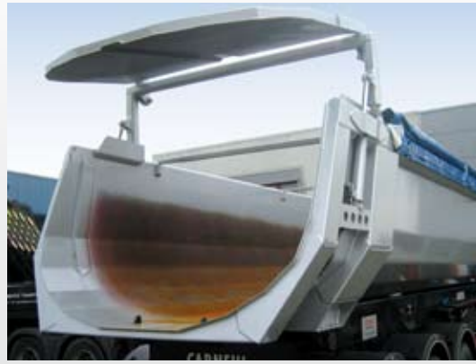
Hydraulic tailgate with large opening