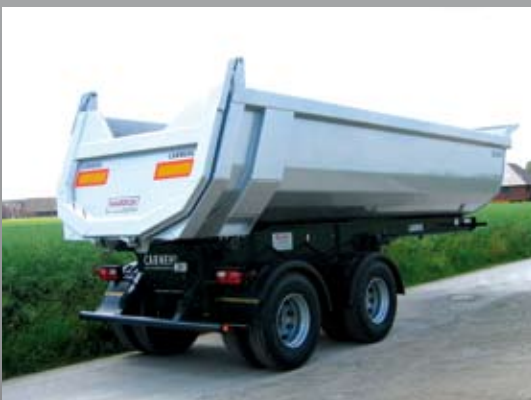
2-axle semitrailer with cutout tailgate